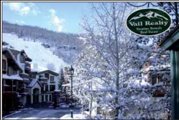
Located in the Heart of Vail Village East of Seibert Circle in the Mill Creek Court Building

Vail Realty is Vail's full-service real estate company, specializing in sales, rental and management of Vail Valley resort properties.